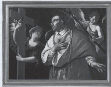
Saint Charles B[ rromeo, Antiveduto Grammatica, oil on canvas, 1612

“Between Thee and Me,” a collaborative project between the Greenlease Gallery’s Van Ackeren Collection of Religious Art and the Michael Klein Judaica Collection at the Epsten Gallery at Village Shalom—a program of the Kansas City Jewish Museum of Contemporary Art— attempts to bridge actual and perceived cultural distances among the artistic, Jewish and Jesuit communities.