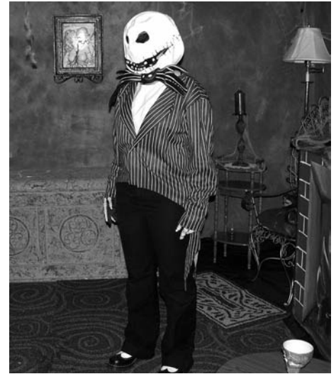
Last year more than 800 visitors attended Safe Trick-or-Treat along with more than 80 student volunteers.