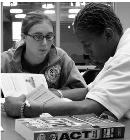
Teens receive help with homework at RU College Bound.

RU College Bound is an after-school program for area middle and high school students. Rockhurst students, staff and an Americorps Vista volunteer meet with participants weekly for mentorship and exposure to the world of higher education. Activities include homework help, age-appropriate college readiness programming, standardized test practice and college application assistance. The free 90-minute sessions are held at the Rockhurst Community Center, 5401 Troost Ave., and are scheduled to start in late September. For more information or to enroll your student, call 816-501-4306.