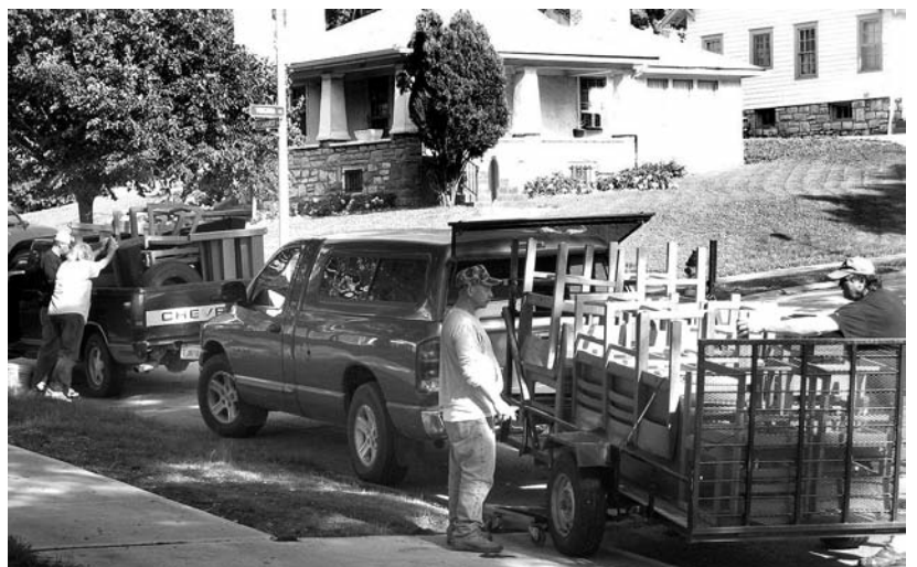
Volunteers load furniture donated from Corcoran Hall.

You may have noticed utility work on Rockhurst Road during June and July. The university updated some of its infrastructure needs such as internet cabling and electrical updates. Off-campus houses also received indoor paint jobs and repairs before students returned for classes in August.